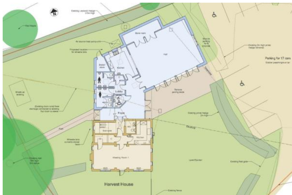
Annexe floor plan (proposed building shown in blue)

Currently, we are awaiting planning permission for the project. Before Christmas we understood that the application was going to be rejected, but at a recent meeting with the planners we found that it is actually being sent up to the planning committee. This means that we get another chance to put our case for the project, and with sufficient local support and prayer we hope that we may still get permission without major changes. The main objections seem to be the size and parking and noise concerns. Unfortunately, to make a significant difference to the size, the hall would have to be made too small to be useful. However, if all the congregation help in whatever ways they can, be it maintaining relations with the Parish Council or merely parking considerably (in the village hall or World's End car park if Harvest House one is full), then there is a reasonable chance that these plans can be realised.