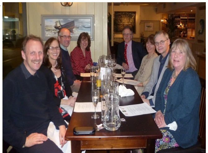
(Above) Elders' outing with spouses.

Our relationship with the other main leadership group within the church, the PCC has been one of mutual respect.