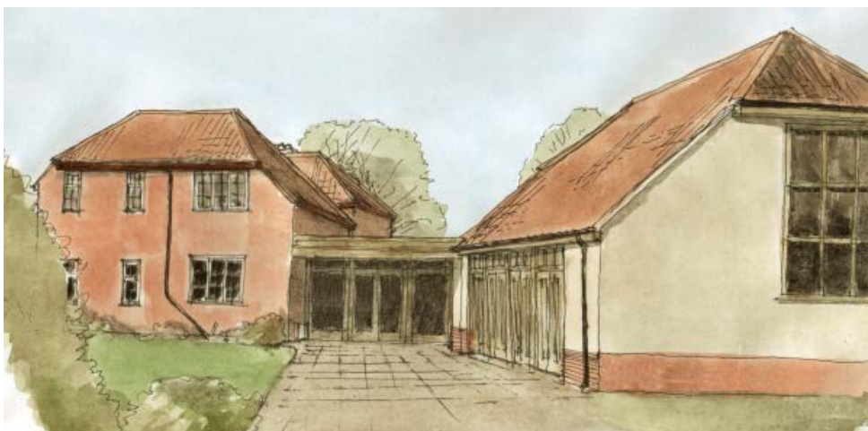
Harvest House and Annexe as seen from the car park

For some time Harvest House has been showing its limitations in terms of size and facilities, particularly for large gatherings. A few years ago, a member of the congregation had a vision of a new, well-appointed hall adjoining Harvest House and the aim of this project is to make that vision into a reality.